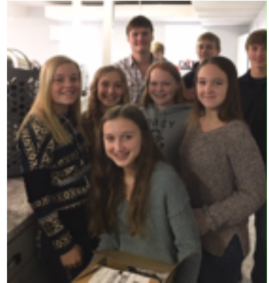
This group of our youth helped the ladies unload and bring things in.